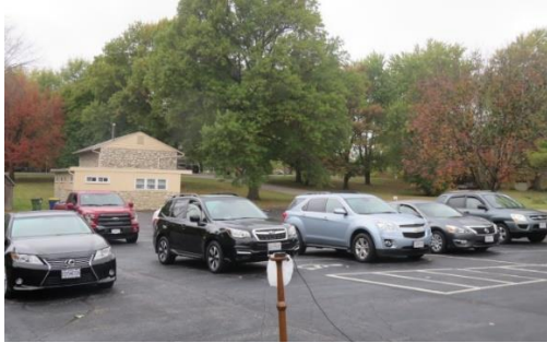
Parishioners in their cars