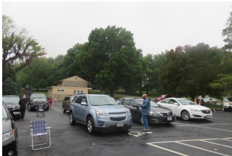
23 in attendance even with the rain!