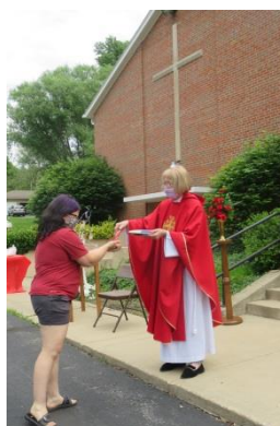
Communion via tongs